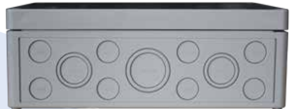
RC-PSB1(-N) image featured.