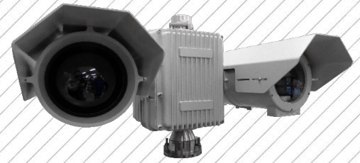
Above: Jaegar Ranger EVO2 25-225mm. Other models will vary.