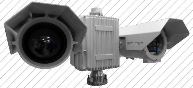
Above: Jaegar Ranger EVO2 25-225mm. Other models will vary.

The Jaegar EVO2 is a high performance, multi sensor platform which utilises long range uncooled LWIR thermal sensors with a range of zoom lens options up to 20-300mm, alongside the latest low light HD visible sensors with zoom lens options up to 20-2400mm. The EVO2 range employs the latest 12µm thermal technology which has push autofocus capabilities as standard.