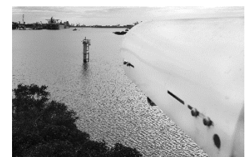
HIGH ACCURACY Designed for long range surveillance applications