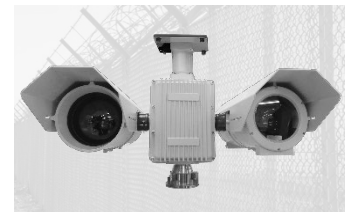
THROUGH SHAFT Enables fixed payloads to be mounted above the PT Director