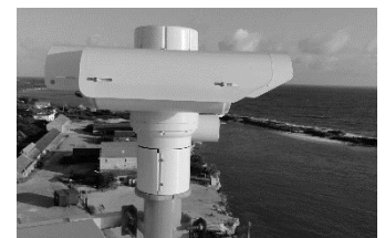
IP67 RATED Ruggedized and well suited to maritime applications