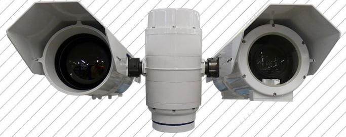
Above: Osiris Ranger EVO2 25-225mm. Other models will vary.

The Osiris EVO2 is an accurate, multi sensor platform which utilises long range uncooled LWIR thermal sensors with a range of zoom lens options up to 25-225mm, alongside the latest low light HD visible sensor with zoom lens options up to 20-2400mm. The EVO2 range employs the latest 12µm thermal technology which has push autofocus capabilities as standard.