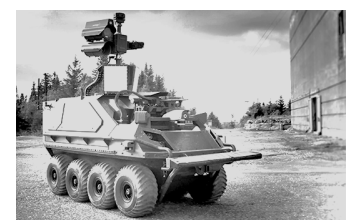
MOBILE DEPLOYMENTS Suitable for mobile and vehicle mounted applications