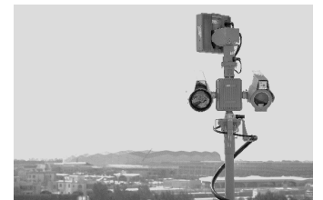
THROUGH SHAFT Enables fixed payloads to be mounted above the PT Director