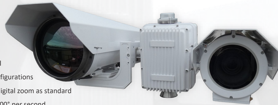
Above: Typical Jaegar Searcher (models will vary)

* Requires the NexOS performance pack and the gyro options