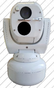
Above: Oculus Scout 50mm Other models will vary.