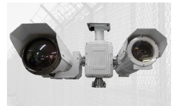
THROUGH SHAFT Enables fixed payloads to be mounted above the PT Director