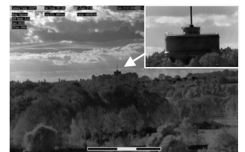
HD THERMAL Providing HD thermal images with a 1280 x 720 resolution