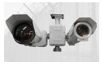
THROUGH SHAFT Enables fixed payloads to be mounted above the PT Director