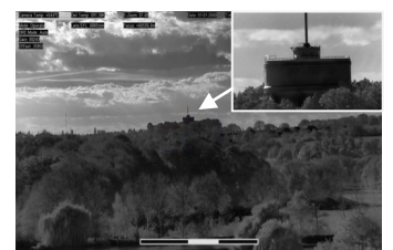
HD THERMAL Providing HD thermal images with a 1280 x 720 resolution