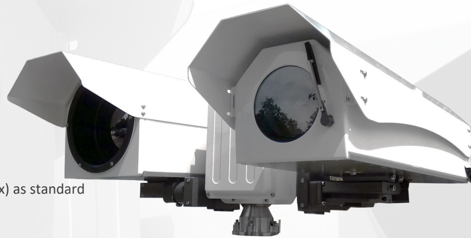
Above: Typical Jaegar Ranger, wiper optional (models will vary)

* Requires the NexOS performance pack and the gyro options