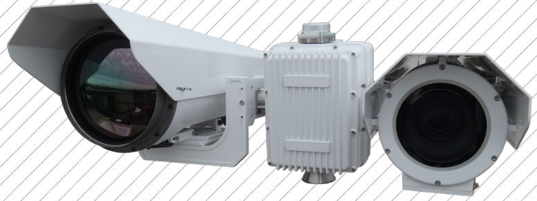
Above: Typical Jaegar Searcher. Models will vary.

The Jaegar Searcher is a high performance, multi sensor platform which utilises long range cooled MWIR thermal sensors with a range of zoom lens options up to 43.6 to 785mm, alongside the latest low light HD visible sensor with zoom lens options up to 20-2400mm . The Searcher employs the latest 15µm thermal technology which has push autofocus capabilities as standard.