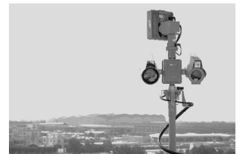
THROUGH SHAFT Enables fixed payloads to be mounted above the PT Director