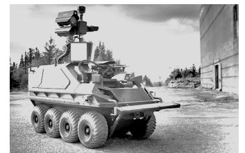
MOBILE DEPLOYMENTS Suitable for mobile and vehicle mounted applications