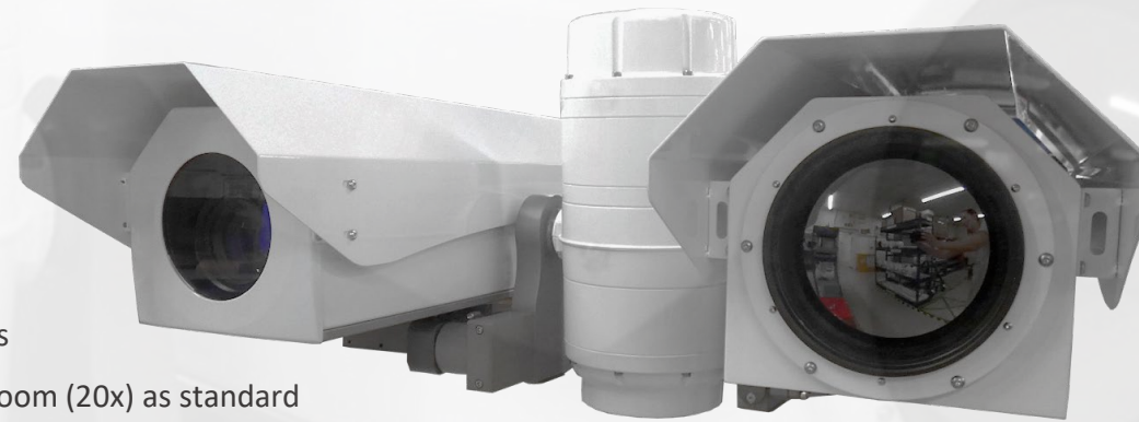
Above: Typical Osiris Ranger (models will vary)

** Johnsons Criteria, (Human at 1.8m x 0.5m, Detection at 2 pixels, Recognition at 8 pixels and Identification at 13 pixels. 50% probability subject to environmental conditions). Based on the JPTX-EVO2-300-W.