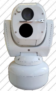
Above: Oculus Scout 50mm. Other models will vary.

UNCOOLED LWIR THERMAL FIXED LENS CAMERAS