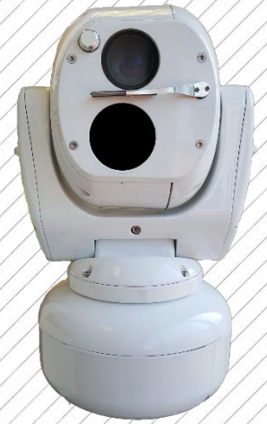
Above: Oculus Scout 50mm. Other models will vary.

The Oculus is a compact, ruggedized, continuous rotation dual sensor PTZ camera utilising an uncooled LWIR thermal sensor with a range of fixed lenses up to 50mm and a HD visible sensor.